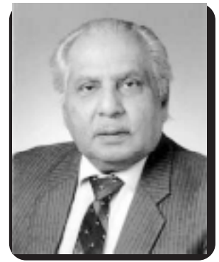
President GSI 2002